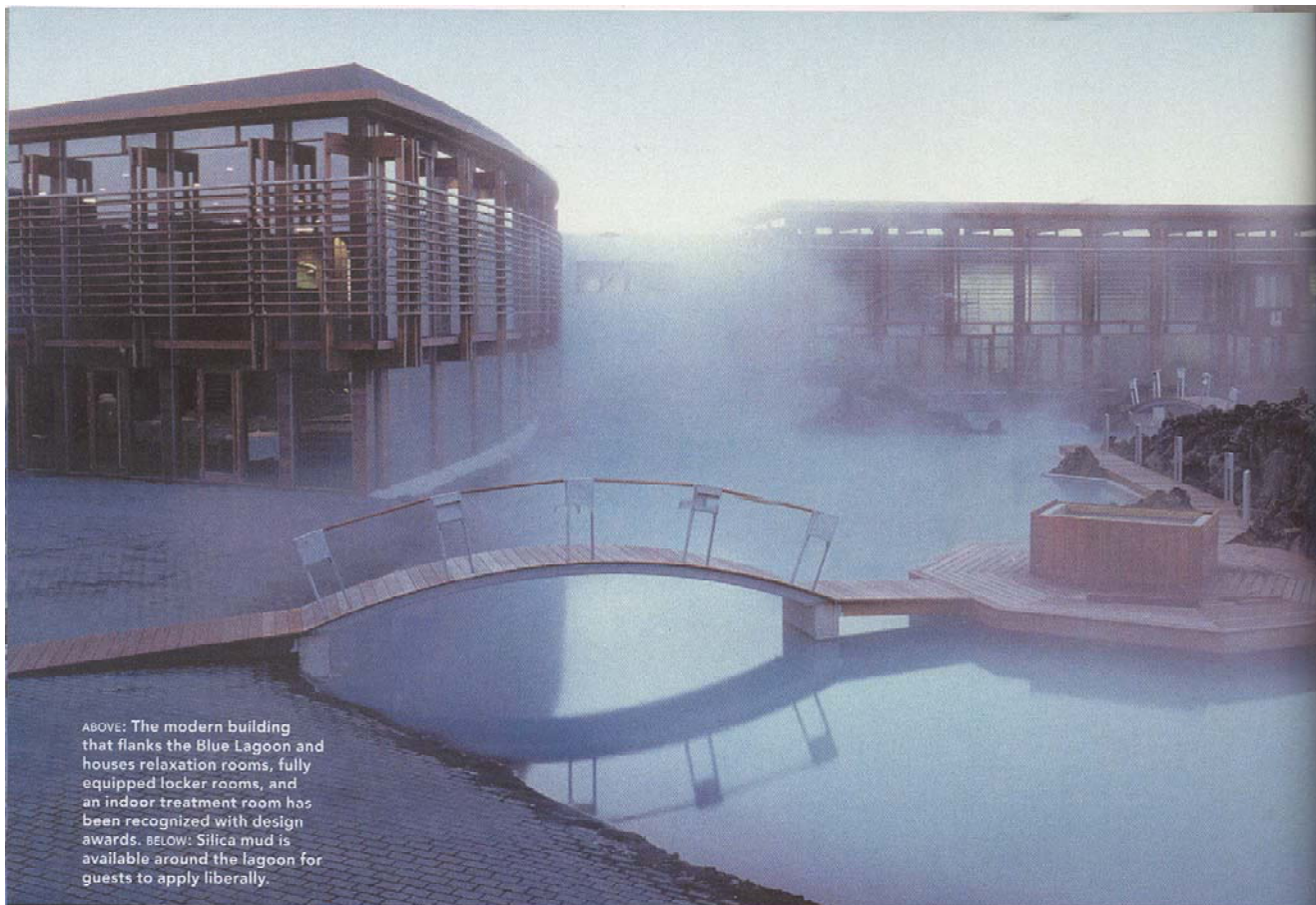
ABOVE: The modern building that flanks the Blue Lagoon and houses relaxation rooms, fully equipped locker rooms, and an indoor treatment room has been recognized with design awards. BELOW: Silica mud is available around the lagoon for guests to apply liberally.